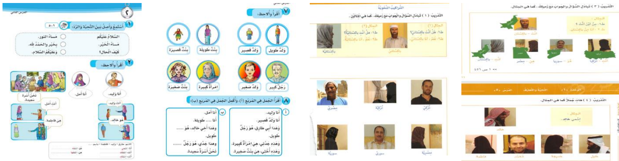
Figure 3. Kunuz Ta'lim al-Lugah al-Arabiyyah (3)

Kunuz Ta'lim al-Lugah al-Arabiyyah volume 1 volume 1, p. 23