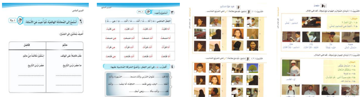
Figure 4. Kunuz Ta'lim al-Lugah al-Arabiyyah (4)

Kunuz Ta'lim al-Lugah al-Arabiyyah volume 1 volume 1, p. 94