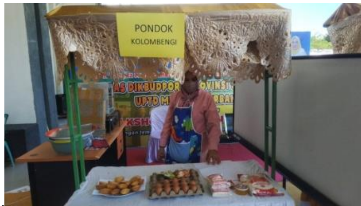
Figure 3. UMKM Kolombengi

The promotion of products produced by MSMEs through social media or online marketing further reduces printing costs (Raharja & Natari, 2021), transportation costs for distributing leaflets, and labor costs for promotion. Meanwhile, promotion by utilizing online social media is much cheaper and more efficient and can reach unreachable markets through offline sales