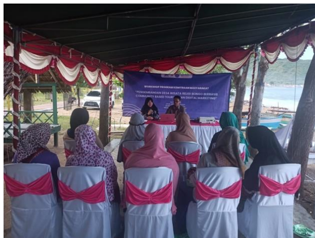
Figure 1. Training and Mentoring Activities

This training and assistance aim to improve the skills of MSME actors in marketing the products produced by using social media and the Bongo Religious Tourism Village website as a means to market products and publications of Bongo religious tourism destinations. The training and mentoring program is carried out to foster an attitude of empathy and sympathy from the community and even the local government. After carrying out this community service activity, the benefits obtained by the MSME community and the existence of a religious tourism village are: