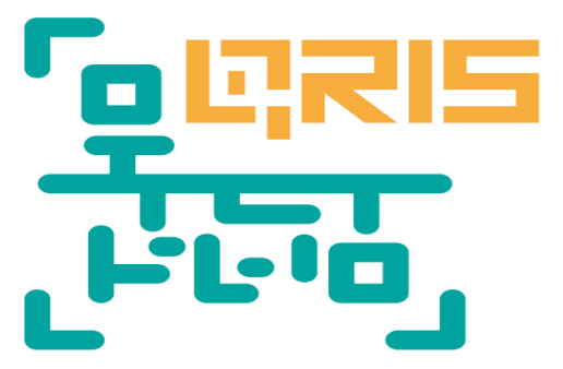
Figure 3. QR code as BSI QRIS digital banking service

for using this service. Of course, the team tries to provide examples in the form of videos and tutorials that help people use them.