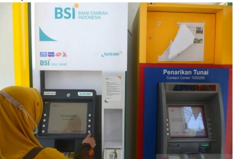
Figure 3. Example of using an ATM card in an ATM

3. ATMs, digital banking services in the form of electronic cards to facilitate banking customers in making transactions using both ATMs (Authorized Teller Machine) and EDC (Electronic Data Capture) machines. In this case, people better understand the use of this ATM service. Most people can use ATM outlets available in the neighborhood. But some people are not good at using it, this is due to age factors and inability to use digital access. So, the team provided one of the demonstration models for the use of ATMs equipped with video tutorial links. The video tutorial explains the stages of using digital products starting from the use of ATMs, Mobile Banking, and E-Money.