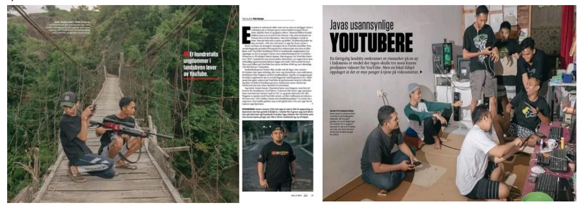
Figure 1. Magazine about YouTuber Tapen Bondowoso's Village Published in USA and Germany Media

YouTuber Village models still need to be found in Indonesia. Even though digital villages or digital villages have emerged, research by Izharsyah et al. (2022) discusses the development of Digital Villages. This research only leads to village administration, which is developed in digital form and has yet to discuss empowerment, especially for youth (Izharsyah et al., 2022). Research conducted by Yunadi and Ardiyanti (2018) and Widodo et al. (2023) on the digital MSME Village program. Both studies show that the Digital MSME Village program can increase sales turnover and increase villagers' income. Both studies differ from this study, which is more directed at the specifications of the YouTuber Village with a youth base (Widodo et al., 2023; Yunadi & Ardiyanti, 2018).