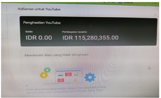
Source. Documentation by researchers Figure 3. One of the initiators' revenue from YouTube in one month

People's income before successfully becoming a YouTuber still needs to be higher. Some touch the District/City Minimum Wage (UMK), and some are even below it as to the information conveyed by the initiator, namely Imam Januar's brother, initially, the income obtained ranged from Rp1,000,000 to Rp1,500,000 monthly as a store employee. But this income has changed after the initiator plunged as a YouTuber content creator known to have experienced a significant increase in income. It ranges from tens dozens, to hundreds of millions in each month. The initiator's income once reached Rp115,280,355.00 in one month.