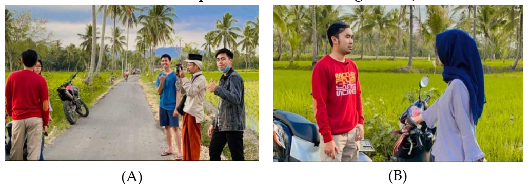
Figure 3. Community Activities while Creating Content or Videos

Content or video produced by YouTubers in the village also varies, ranging from short films to health content, Islamic content, and others. Of the several types of content, Islamic or religious short films, and videos are some of the content choices YouTubers often produce. The content of the short film in question is like an inspirational video, and the video contains lessons played by a person or a group of people with a fairly short duration. However, there is a very valuable moral message in it. Meanwhile, one of the Islamic content produced is chanting solawat and prayers of life (Observation in YouTuber Tapen Bondowoso Village, 2023).