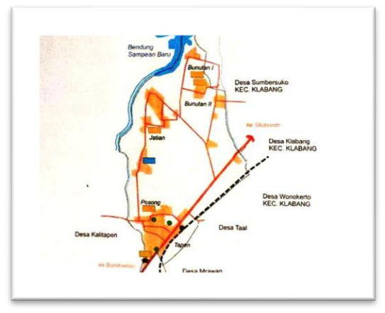
Figure 2. Map of Tapen Village, Tapen District, Bondowoso Regency

Geographically, Tapen Village also has Natural Resources (SDA) that are quite abundant in it. Among several existing natural resources, land in the form of rice fields has one of the highest natural resource potentials compared to other natural resources, reaching 274,246 ha. Rice fields have a large enough land area, so it is unsurprising that farming activities are also one of the population's livelihoods, which is quite high compared to other professions (Desa Tapen, 2021). However, after people discovered that YouTube could bring in a fairly high income, many people ultimately competed to become a YouTuber. The activeness of several youths or the community in creating as content creators YouTubers also makes the economic condition of the community (YouTubers) better. In this respect, it is very different from the previous economy. One of the proofs can be seen from the community's income, which is known to be higher between before and after becoming a YouTuber (I.Januar et al., 2023).