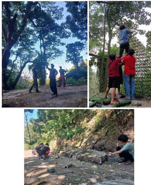
Figure 5. Joint Activities and Safety Inspections of Tourist Attractions

The empowerment process fostered stronger communication between the village government and local tourism actors, resulting in more coordinated efforts to promote the destination through social media and community networks. This finding aligns with the principles of Asset-Based Community Development (ABCD) described by Alamri et al. (2025), which emphasize that community-driven initiatives are more sustainable when grounded in existing local capacities and assets (Alamri et al., 2025). These strengthened collaborative practices directly reinforce the program's primary objectives by enhancing the quality of tourism services and empowering the community to take an active, collective role in managing the destination.