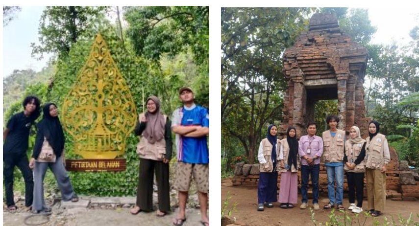
Figure 4. Thematic photo spots are in the Ken Dedes Spring Area and the Belahan Temple Courtyard.

In addition, new thematic photo spots were developed to highlight local cultural heritage, such as the Ken Dedes Spring Area and the Belahan Temple Courtyard. These enhancements not only improved the visual appeal of the tourism area but also increased visitor engagement and satisfaction. Similar initiatives have been noted by Nofiyanti et al. (2021), who found that strengthened visual identity and aesthetic improvements significantly enhance the attractiveness and competitiveness of tourism villages (Nofiyanti et al., 2021). These outcomes directly support the program's core objectives by enhancing the overall quality of tourism services and empowering the community to contribute to the development of the destination actively.