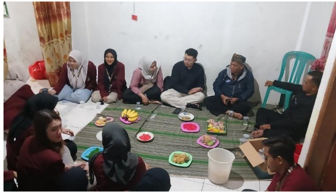
Figure 2. Discussion on preparations for the implementation of Sapta Pesona .

After attending the workshop, participants demonstrated significant improvements in conceptual understanding, as evidenced by an increase in their average knowledge score from 42% in the pre-training assessment to 81% in the post-training evaluation. Observable behavioral changes in the field accompanied this cognitive improvement. Quantitative monitoring results showed that 87% of participants consistently applied hospitality principles by greeting visitors appropriately, 76% demonstrated increased compliance with order in managing parking areas, and 82% implemented better hygiene practices at their respective work points, including food stalls and public spaces. Collectively, these data demonstrate a substantive shift toward more professional and service-oriented behaviors aligned with the Sapta Pesona framework.