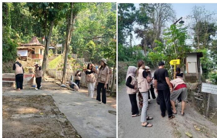
Figure 3. Field mentoring improved the cleanliness, organization, and aesthetics of the tourism area.