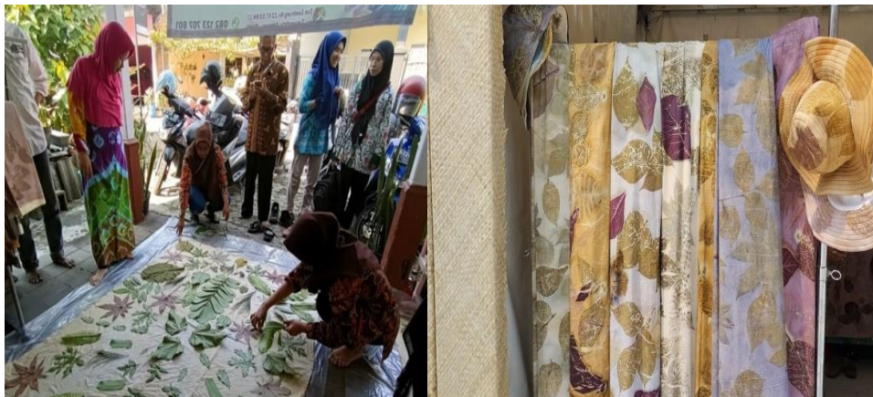
Figure 2. Green Innovation in Batik Through Ecoprint Technique

The implementation of this community service program successfully introduced the eco-print technique as an environmentally friendly innovation in the Batik production process. During the training sessions, artisans were able to produce eco-print Batik samples using various types of leaves and flowers, resulting in unique natural patterns. Participants demonstrated increased skill in arranging plant materials, applying pressure techniques, and controlling steaming duration to produce consistent color outcomes. The use of natural dyes also reduced dependence on synthetic colorants, contributing to lower production costs and minimizing hazardous waste generation. In addition, the artisans reported improved product aesthetics and expressed strong interest in further developing eco-print designs for commercial purposes (Alfarizi et al., 2024; Mardiana et al., 2020; Nadagouda et al., 2020).