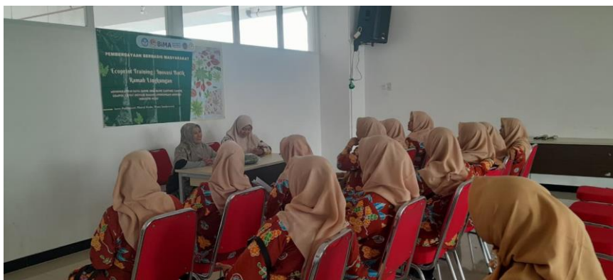
Figure 3. Material Presentation Session

To support more efficient eco-print production, two primary technologies were designed: the Eco-Print Batik Steamer and the Batik Dryer. The Eco-Print Batik Steamer was designed to optimize the extraction of natural dyes onto fabric through a steam-heating system powered by either electric elements or a gas stove. The following activities illustrate the design and implementation of appropriate technologies aimed at enhancing production efficiency and effectiveness in mitigating weather-related uncertainties, with the ultimate goal of improving the productivity of Batik artisans: