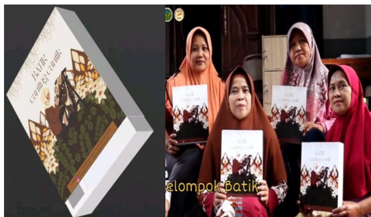
Figure 6. Packaging Design of Batik Canting Cantik Products

The next equipment is the Batik Dryer , a technology designed to accelerate the drying process without damaging the fabric's color or fibers. This tool is made from 1.5 mm galvanized iron, equipped with aluminum racks, and measures 150 cm × 100 cm × 60 cm. It is capable of drying 4–5 sheets of fabric in a single process and is supported by an 800–1000-watt blower heater with a temperature range of 50–70°C, along with an automatic temperature control and timer system. The Batik Dryer offers several benefits, including reduced dependence on weather conditions, a shorter drying time of 1–2 hours compared to 4–6 hours, and improved energy efficiency compared to oil- or gas-based heaters. In addition to innovations in the production process, this program also enhanced the partners' digital marketing capabilities by utilizing social media platforms and online marketplaces, as well as improving Batik packaging design to make it more attractive and increase its market value.