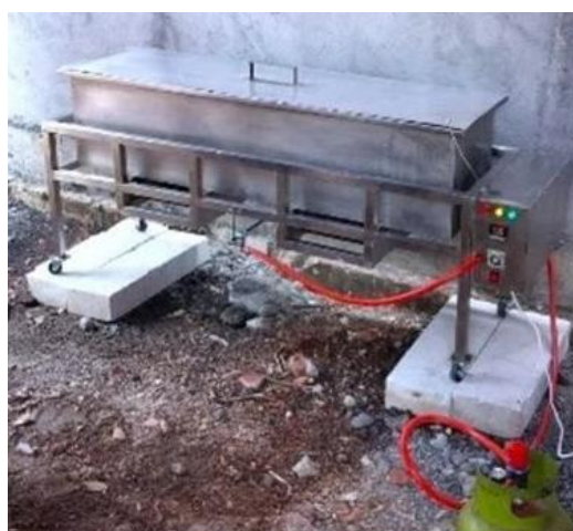
Figure 5. Eco-print Batik Steamer

The specifications of the designed equipment are as follows: it is made from Stainless Steel 304 with dimensions of 70 cm in diameter and 60 cm in height, and has a capacity to process 5–10 sheets of fabric at once. The equipment is equipped with aluminum or steel wire racks to ensure even steam circulation, operates at a temperature range of 80–100°C, and includes a small pressure ventilation system. The benefits of this design include improved production efficiency, enhanced color durability, and support for the eco-print trend, which utilizes natural dyes.