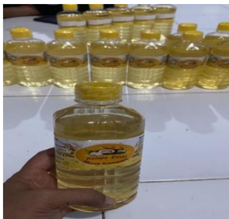
Figure 4. Packaged Coconut Products

The activities shown in the image illustrate the active engagement of participants in the learning process, indicating an increased level of understanding and readiness among MSME partners to develop processed coconut-based products and utilize digital technology for marketing, including broom products. Furthermore, product packaging training was conducted as part of the workshop on coconut product processing. During this training, participants learned techniques for attractive and proper packaging and storage of products. Attractive and informative packaging serves as a crucial marketing strategy, as consumers' initial perceptions of a product are often shaped by its packaging.