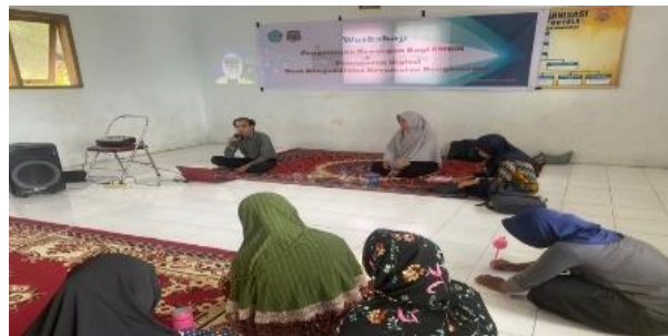
Figure 1. Presentation of material and discussion

The next stage was the extension activity, through which partners were expected to gain an initial understanding of the potential and benefits of coconut-based products. This understanding served as a foundation for the subsequent stages of training and practical product processing activities. The extension material was delivered in a single, 120-minute face-to-face session.