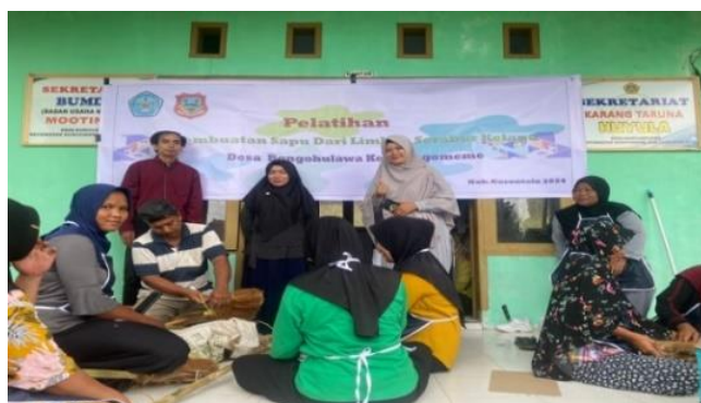
Figure 3. Broom Making Training

training was conducted to utilize coconut fiber waste by transforming materials with no economic value into products with higher economic potential. The process of making brooms from coconut fiber is relatively simple and requires only basic equipment. The coconut fibers are soaked for approximately 30 days, separated from the outer husk, and then sun-dried until completely dry. Following the acquisition of basic knowledge in the earlier training sessions, subsequent activities emphasized more applied training to develop participants' skills further and strengthen the partners' practical competencies.