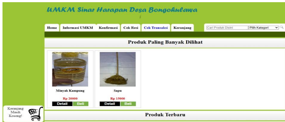
Figure 5. E-Commerce Display for UMKM Products

The image above illustrates the process of creating food product packaging. The label also lists the product's benefits, including its ability to support overall body health and its use for both consumption and skincare. It also includes information on the net weight/contents, production date and information, and instructions for use and storage.