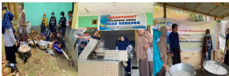
Figure 2. Pure Coconut Oil Making Practice

The activities depicted in the image demonstrate the active participation of MSMEs in Bongohulawa Village in understanding the utilization of coconuts as a value-added product and the introduction of e-commerce as a marketing tool. The image supports the discussion by providing visual evidence that the outreach and mentoring activities were implemented in a participatory manner. The outreach phase also included training on coconut processing, particularly the production of Pure Coconut Oil. This training was conducted under the direct guidance of the implementation team, enabling participants to follow each step of the process easily. The resulting Pure Coconut Oil was clear and odorless, indicating that the production process was successful.