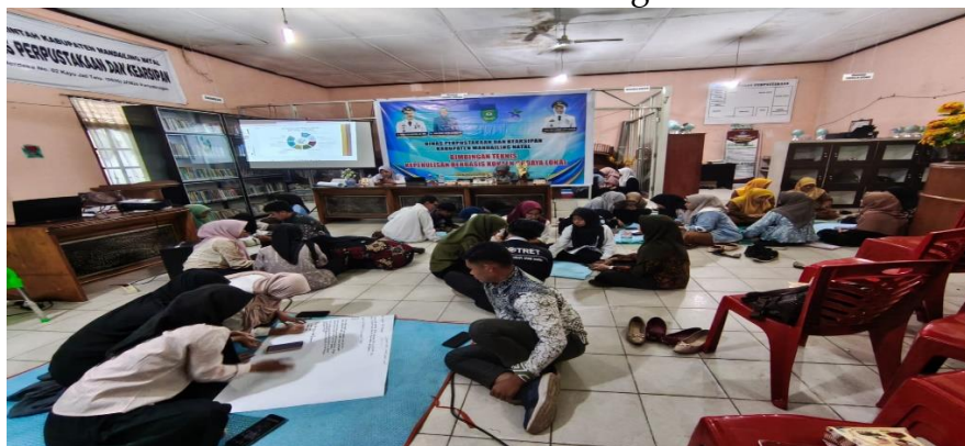
Figure 1. Implementation of training

The training began on July 14, 2025, and lasted for two weeks. Each training session lasted two hours, with material provided covering creative writing techniques, manuscript editing, and ISBN registration procedures. Participants were divided into small groups to discuss specific topics, such as writing folktales and customs. Each group consisted of various community members, including students, university students, teachers, librarians, and literacy activists, who were actively involved in group activities that supported the development of participants' skills, as shown in Figure 1. Every day, participants engaged in writing exercises and received direct feedback from the facilitator to enhance their writing skills.