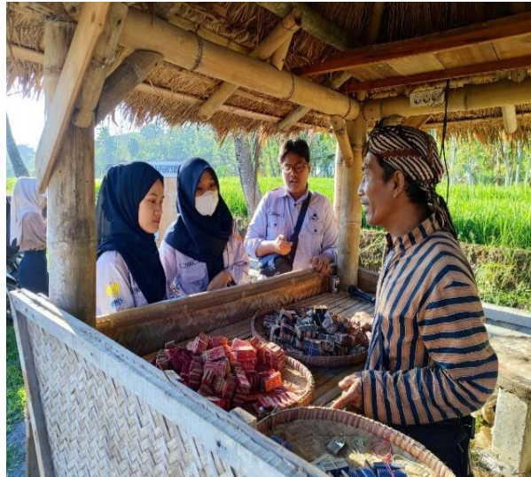
Figure 4. The Process of Exchanging Uli Money to Be Used by Visitors

Economic equality in Pasar Sawahan activities is highly structured: profits are distributed after activities are completed, and sellers exchange the uli money they earn for rupiah. The system of exchanging rupiah for uli money aims to introduce traditional transactions and become an icon in the unique buying and selling process (Afandi et al., 2024). Sellers then provide input and evaluations during the buying and selling process.