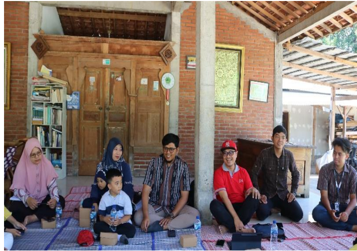
Figure 3. Pokdarwis Meeting in Preparation for the Pasar Sawahan Activity

reminding one another. This shows that the village's social control mechanism significantly contributes to the sustainability of governance (Muazza et al., 2025).