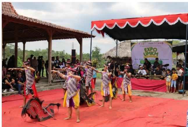
Figure 5. Kuda Lumping Performances as a Form of Socio-Cultural Sustainability in Kalongan Village

The socio-cultural sustainability of Pasar Sawahan is evident in the cooperation between older and younger generations in preserving traditions. Senior citizens serve as cultural resource persons, teaching local cuisine, craft-making techniques, and village history. Meanwhile, the younger generation utilizes social media to promote this culture to a wider audience. The combination of the older generation's experience and the younger generation's creativity creates a relevant and interesting cultural blend (Kay Smith et al., 2022).