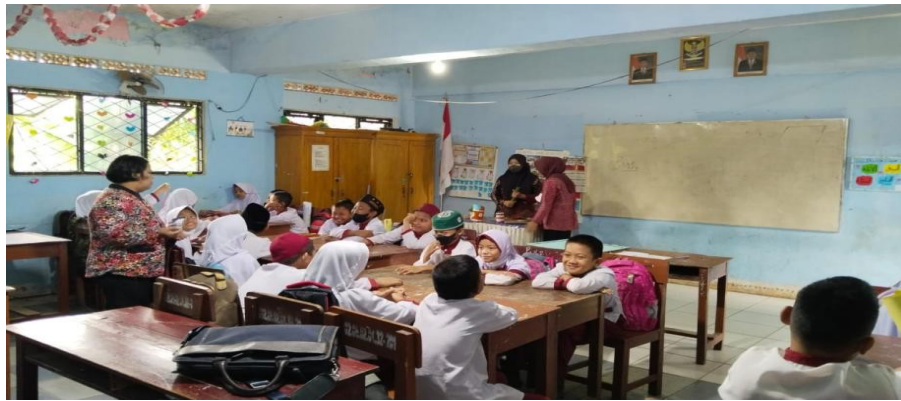
Figure 3. Introduction to Waste, Plants, and Forming Groups

Based on interviews and observations, the researchers concluded that during the introductory phase, the facilitator team introduced students to waste and plants. They were then given a questionnaire as an initial assessment, which was useful for grouping students.