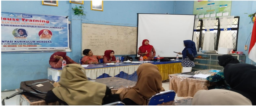
Figure 1. KKG Meeting of Public Elementary School 149 Palembang