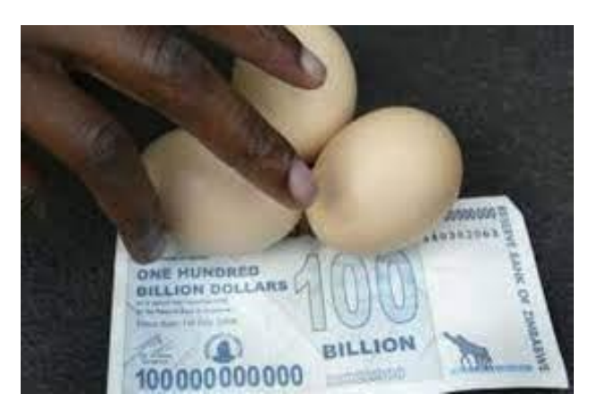
Figure 1. Zimbabwe Currency 100 Billion Can only buy 3 eggs

Its people face a scarcity of food, fuel, and medical equipment during the Covid-19 pandemic, which has even paralyzed developed countries (Alonso, 2020). EXX Africa said, "Even in the best case scenario, Zimbabwe is once again facing hyperinflation that will destroy its economy, catastrophic famine and social instability that threatens to threaten neighboring countries, and the danger of military intervention to seize power again." (Simou, 2014)