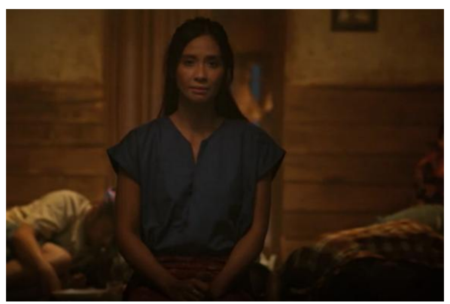
Figure 11. Smiling when he managed to poison four men