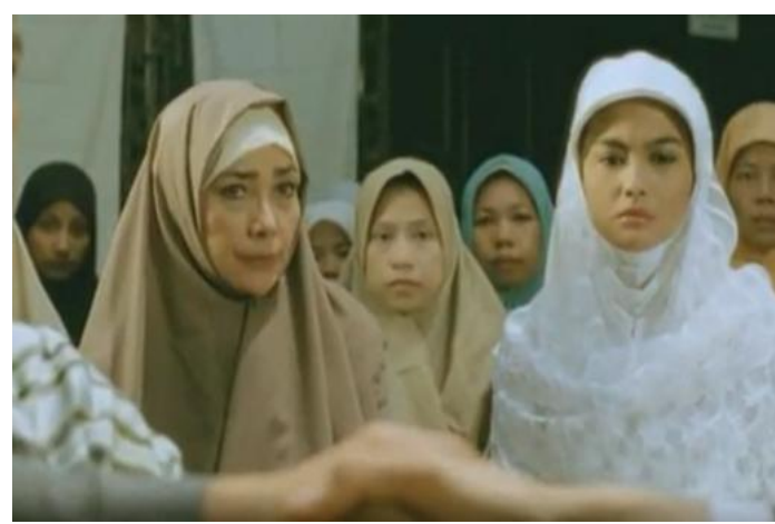
Figure 19. Married by father's decision