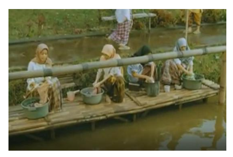
Figure 18. Santriwati washing clothes