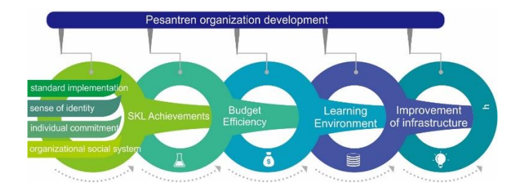
Figure 1. Competitive Pesantren Development Model

Thirdly, a partnership network of Pesantren is being developed. The government's focus on the development of Pesantren has increased in the last three years. Through UPTD Dayah, the government has organized support programs to improve Pesantren, such as student creativity competitions between Pesantren and various programs to help students develop their hard and soft skills.