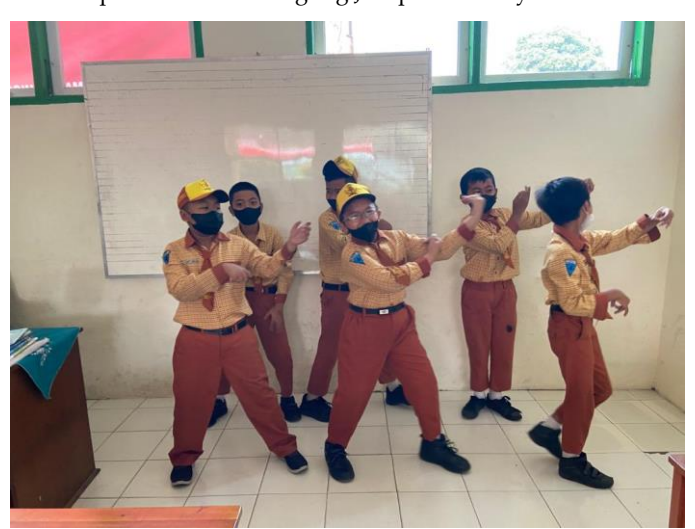
Figure 3. The practice of the Bengong Jumpa Dance for Class IV B students