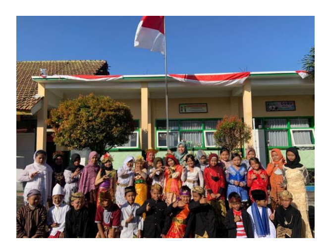
Figure 6. Students Wearing Traditional Clothing from Various Regions in Indonesia