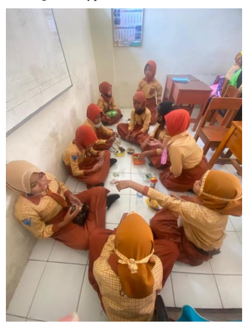
Figure 5. Group Activities