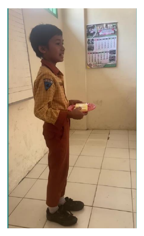
Figure 4. Typical Food Presentation