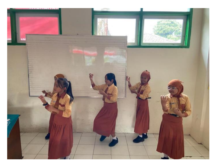
Figure 2. The practice of the Bengong Jumpa Dance by Class IV B students