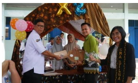
Figure 3. Wood Waste Processed Products (Entrepreneurship Theme)