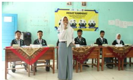
Figure 2. Student Council President Candidate Debate Activities (Democratic Voice Theme)

Office, all high school principals in Pringsewu Regency, Student Council administrators in Pringsewu Regency, and parents of students. The following is the work of the students at Bina Mulya High School: