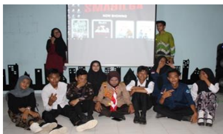
Figure 4. Film Appearance (Theme Build Soul and Body)

However, in the implementation of the P5 Project, some problems still become obstacles, but on the other hand, the Project implemented in the school has advantages. The shortcomings still found are problems regarding the efficiency of Class Hour (JP) time in each theme; besides that, there is a need for improvement again regarding the P5 Project. Still, on the other hand, it also has advantages because Bina Mulya High School is a Mobilization School that related parties have more intensively guided, besides that school residents have also carried out their duties optimally so that the projects displayed are very creative and innovative so that the objectives from the Strengthening the Profile of Pancasila Students (P5) project at Bina Mulya High School can be fulfilled.