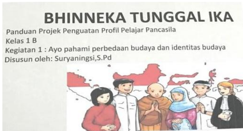
Figure 2. Project Module Penguatan Profil Pelajar Pancasila

Figure 2 shows the project module Penguatan profil pelajar Pancasila. It includes general information, core competencies, and appendices. General information includes a brief description of the project, dimensions of the project module, Strengthening the related Pancasila student profile, specific objectives, project activity flow, assessment, lighter questions, remedial questions, and student and educator reflections. Core components include the material to be studied, the learning path, and the objectives of the learning activities. Appendices include student worksheets, reading materials for educators and learners, glossaries, and a bibliography. These materials are designed to help students remember the material and ensure students do not forget.