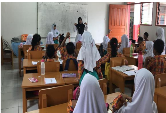
Figure 3. Develop an Engaging Classroom Attitude and Atmosphere

The documentation results show that the teachers in this elementary school made an attendance book containing student data consisting of student parent numbers, student names, and attendance dates in a month. This document indicates compliance with attendance regulations. Teachers use codes for daily absences, such as S (illness), I (permission), and A (alpha), and point codes for students in attendance. At the end of the month, teachers recap attendance using a predetermined formula to ensure that students are recorded and attended effectively.