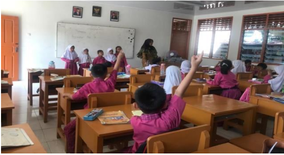
Figure 7. Material discussion and Percentage of teaching materials