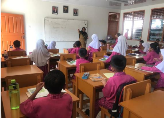
Figure 5. Checking Student Attendance