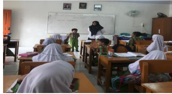
Figure 8. End a lesson by providing conclusions

Teachers play an important role in improving student readiness by understanding the purpose of the material, explaining the learning objectives, and providing an outline. Teachers also offer alternative learning activities by understanding students' interests and talents, creating practical tasks, exercises, and homework, and overcoming barriers by providing learning options, engaging students, and adequate facilities.