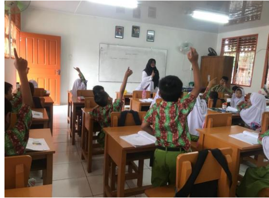
Figure 6. Ask questions about teaching materials

These teachers create an engaging classroom environment by motivating students through friendly greetings, innovative learning methods, and feedback. Teachers use early activities, such as reading prayers, singing national songs, and ice breaking , to develop an attitude of preventing boredom. Teachers also use unique learning media to enhance the learning experience. Student attendance is monitored through an attendance book containing student data, and teachers check student attendance regularly. Teachers increase students' learning readiness through lighter questions, initial tests, and lesson questions. Teachers also encourage students to tidy up the environment around students to increase self-confidence and prepare students for learning activities.