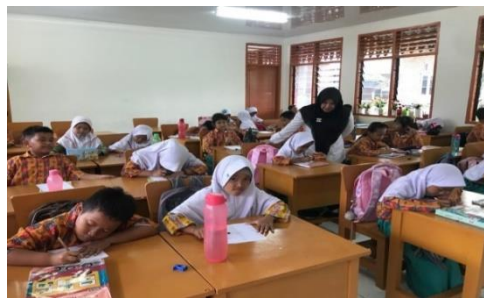
Figure 9. Provide motivation and tutoring

The observations found that teachers assess learning outcomes through practice questions, summaries, and group discussions. Teachers assign homework when students find difficult material or time constraints hinder its completion and deepen the subject matter. Teachers inspire students through engaging activities, challenging misconceptions, and providing positive feedback. Teachers reward bold and correct answers and guide learning for students who do not understand.