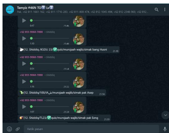
Figure 2. Input collection by the student

After the homeroom teacher finished giving the material, the participants were given the opportunity to memorize the songs that would be deposited in the study group together, and also the participants corrected each other's written assignments in private chat. The input is then sent to the study group collectively.