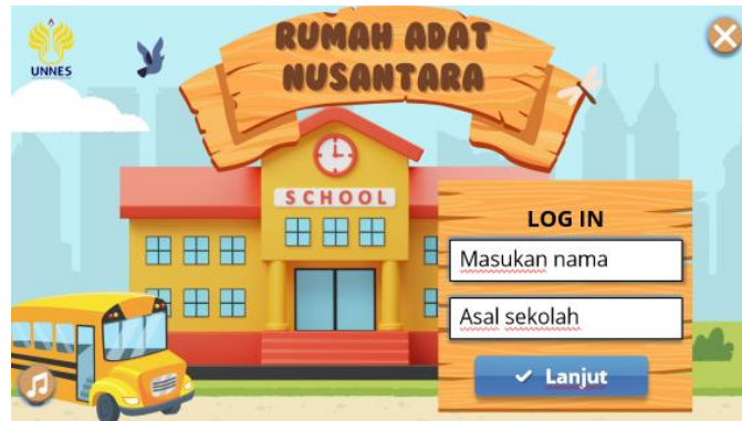
Figure 1. Media Initial Display

application. The application can be run using a smartphone. The results of media development are presented in Figure 1.