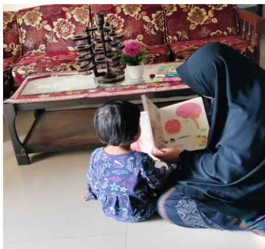
Figure 8. Implementation of NAA Family Sky Parenting in Increasing Children's Interest in Reading

The implementation of sky parenting in increasing children's interest in reading is an approach that focuses on developing spiritual and religious values through reading activities. First, parents who apply sky parenting often choose reading materials that include religious stories, scriptures, or other spiritual literature that can stimulate children's interest in reading. This selection aims to provide a reading experience related to religious values instilled in the sky parenting approach (Syafarina, 2020).