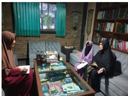
Figure 5. AL Family Interview

Furthermore, sky parenting helps accustom children to reading consistently through activities related to spiritual values. Religious books, stories, or literary materials containing moral messages are often preferred, creating positive reading habits early on. The importance of parental role models in parenting sky also cannot be ignored. Parents who show enthusiasm for religious or spiritual literature set a positive example, encouraging children to love and appreciate reading. This example creates a solid emotional bond between a child's interest in reading and the values instilled in parenting the sky.