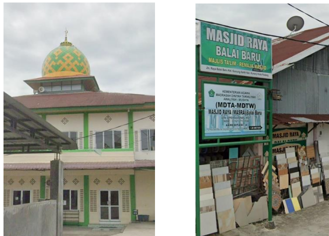
Figure 1. Balibaru Grand Mosque, Kuranji, Padang, West Sumatra

This research is a qualitative approach to deepen the understanding of parental care in increasing children's interest. The research design used is a case study, allowing researchers to investigate this phenomenon deeply and contextually, unearthing deep insights from the parent and child perspective. The location of the study is in the environment around the Balai Baru Grand Mosque, Kuranji, Padang, West Sumatra, as shown in the picture below: