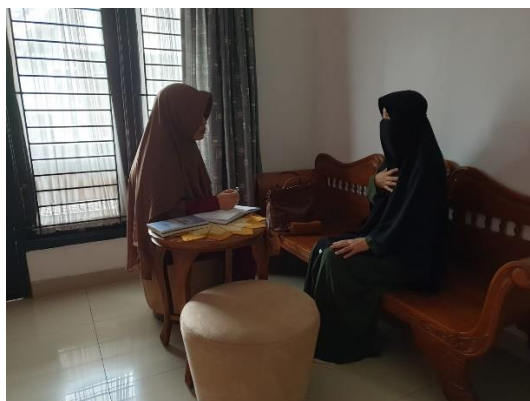
Figure 4. KSF family interview

The interview results above show that religious texts are often very effective learning tools in this context. Parents who practice sky parenting tend to introduce children to readings that include religious teachings, providing opportunities for children to engage in deep and meaningful reading activities.