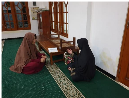
Figure 6. NAA Family Interview

Finally, sky parenting opens the door to developing children's holistic understanding of literacy (Putro et al., 2022). Children are fixated on the technical aspects of reading and are taught to reflect, consider, and incorporate spiritual values in their reading activities (Utari & Hamid, 2021). This encourages the development of a more profound and sustainable interest in reading throughout the child's life. Based on the results of the interview show that Sky Parenting has five positive influences in increasing children's interest in reading, as can be illustrated as follows: