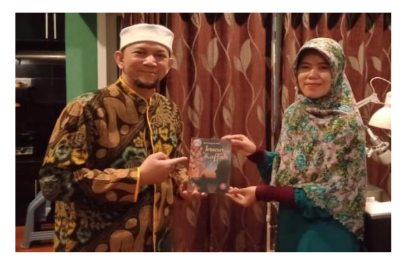
Figure 2. Owner of the IHAQI Creative Islamic Boarding School Bandung

The development of pesantren has had very significant changes from time to time, especially since the world is now responding to the acceleration of the industrial revolution 4.0, which has increasingly rapid technological sophistication (Lase, 2019). As a result, the development of pesantren shifted from the current stage to the post-modern stage in the 21st century. One of the pesantren educational institutions that have a post-modern concept is the IHAQI Creative Pesantren. Post-modern pesantren is an Islamic boarding school that combines various modern technologies in the learning process and develops various scientific disciplines and skills needed without eliminating Islamic values.